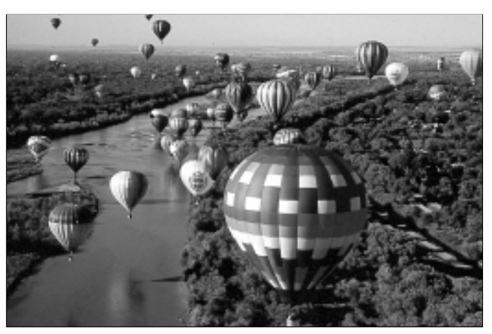
Albuquerque Balloon Fiesta.

Albuquerque is a community with a rich history and a diverse collection of ethnic groups, including a strong Native American influence. Many of the available attractions from a cultural and historical perspective are available on www.albuquerque.com/ arts/index.html and www.abq.cvb.org. Explore these Web sites for the opportunity to visit old parts of the community or to take advantage of outdoor recreation in the area.